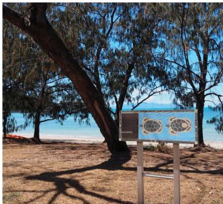
Native trees and bushland.