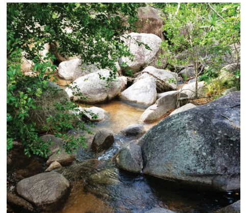
Creeks and reserves.