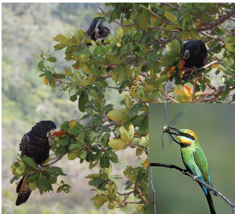
Wildlife feeding and nesting sites.