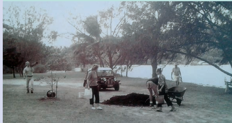
Above: Planting black cockatoo food trees almost 20 years ago.

Previously called Geoffrey Bay Coastcare and Olympus Crescent Coastcare, the group helps look after natural areas on public land at Arcadia with approval from National Parks and Townsville City Council. Group activities include weed control, assisted natural regeneration, tree planting, habitat protection, interpretation and workshops for community consultation and knowledge sharing.