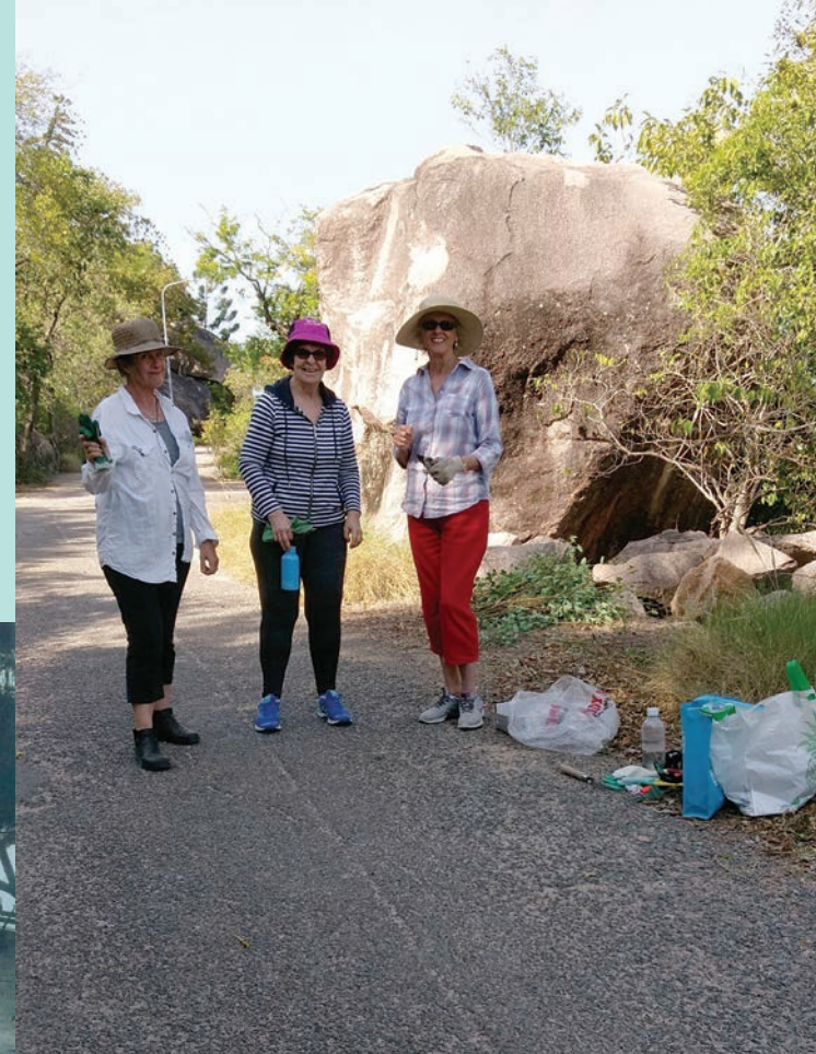
Some of Arcadia Coastcare's weeding gang. All welcome!

For more information, visit www.arcadiacoastcare.com.au or email arcadiacoastcare@gmail.com