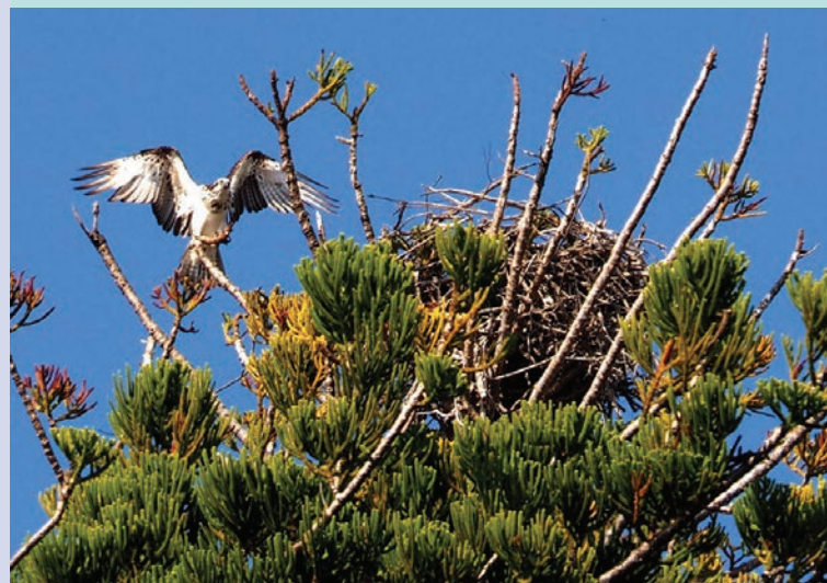
Below: Osprey returning to its nest.